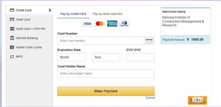
Step 6: Make payment through your preferred mode, i.e., Credit Card / Debit Card / Net Banking