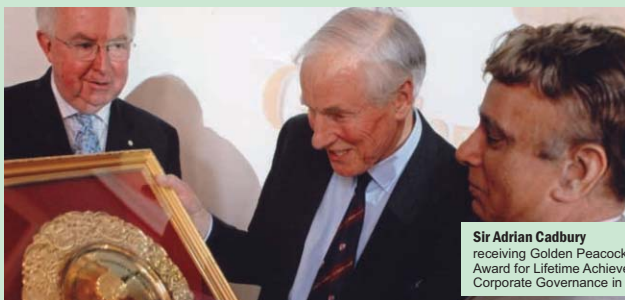
Sir Adrian Cadbury receiving Golden Peacock Global Award for Lifetime Achievement in Corporate Governance in 2016

Currently, the Golden Peacock Awards Secretariat is inviting applications for the following institutional awards for 2017: