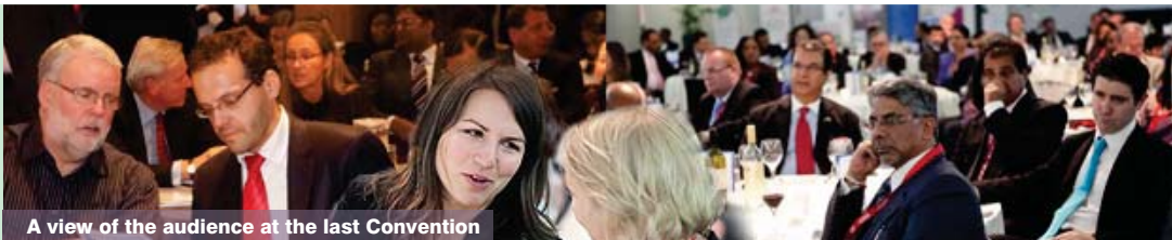
A view of the audience at the last Convention