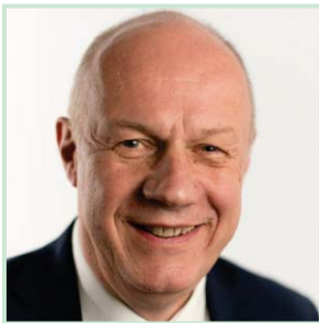
The Rt Hon Damian Green MP First Secretary of the State and Hon'ble Minister for the Cabinet Office Govt. of U.K.