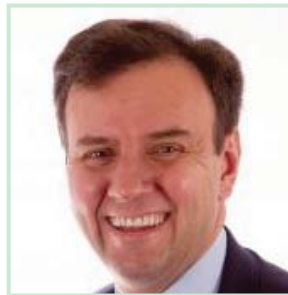
The Rt Hon Greg Hands MP Hon'ble Minister of State for Trade and Investment and Minister for London Govt. of U.K.