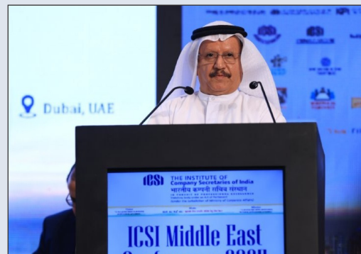
Guest of Honour: H.E. Dr. Mohammed Saeed Al Kindi Senior Vice President, Invescore and Former Minister for Environment & Water, UAE

Stressing upon the importance of collective efforts, H.E. Dr. Mohammed Saeed Al Kindi, said "I am delighted to be a part of this thought-provoking ICSI Middle East Conference. The discussions would surely provide valuable insights and guidance to the policymakers, corporate leaders, and regulators".