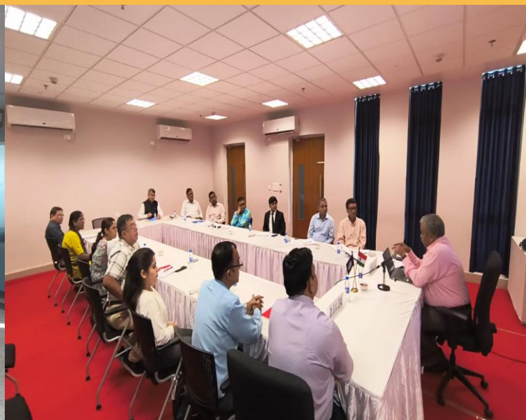
Previous Residential Programme