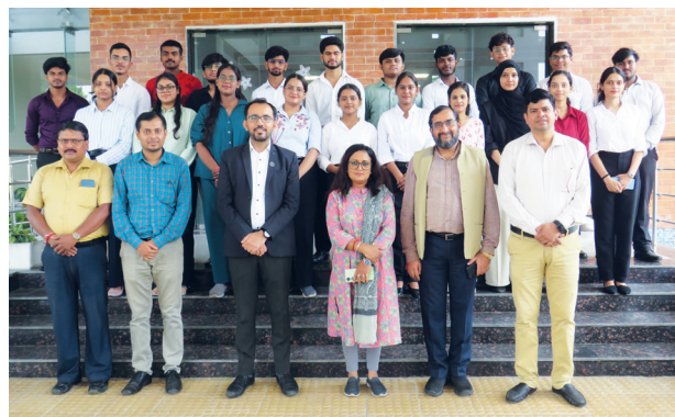
14 th Three Days Orientation Programme was organised by EIRC of The ICSI at ICSI-CCGRT, Kolkata from September 18-20, 2025.