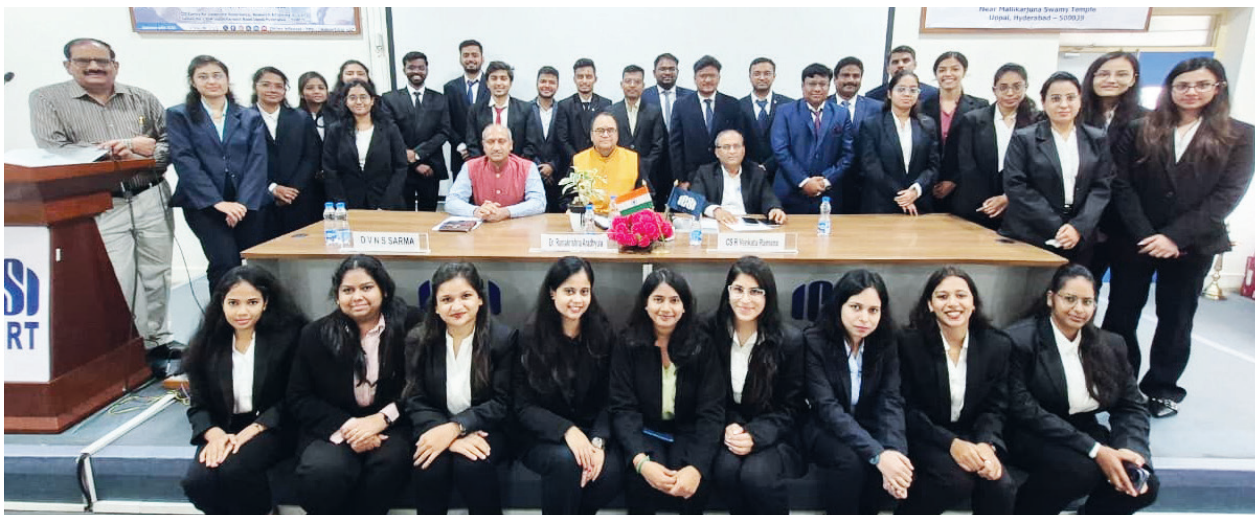
ICSI-CCGRT, Hyderabad organized the inaugural session of its 23 rd batch of the Residential CLDP on September 15, 2025. CS R. Venkata Ramana, Central Council Member, The ICSI and Convenor of ICSI-CCGRT, Hyderabad graced the session.