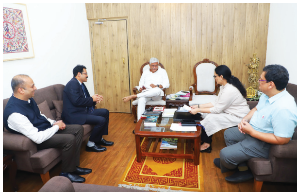
ICSI delegation led by CS Manoj Kumar Purbey, Central Council Member, The ICSI met with Shri Gajendra Singh Shekhawat, Hon'ble Minister of Culture and Tourism to discuss avenues of collaboration and the role of CS in Nation Building.