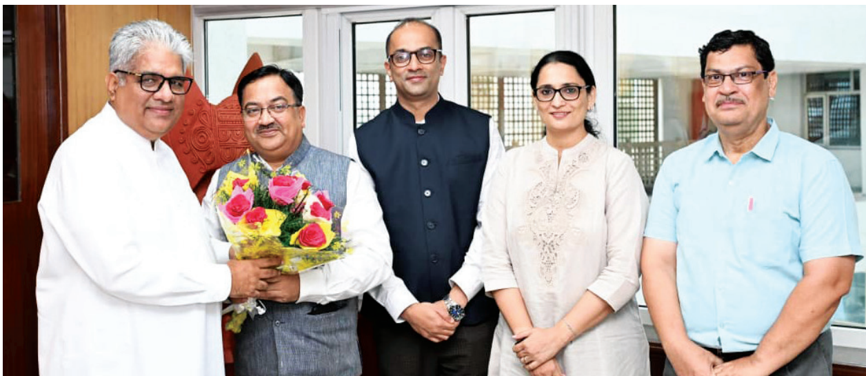
ICSI delegation led by CS Dhananjay Shukla, President, The ICSI met with Shri Bhupender Yadav, Hon'ble Minister for Environment, Forest & Climate Change, to apprise him about ICSI's initiatives taken towards fostering Sustainable Business Practices in India Inc.