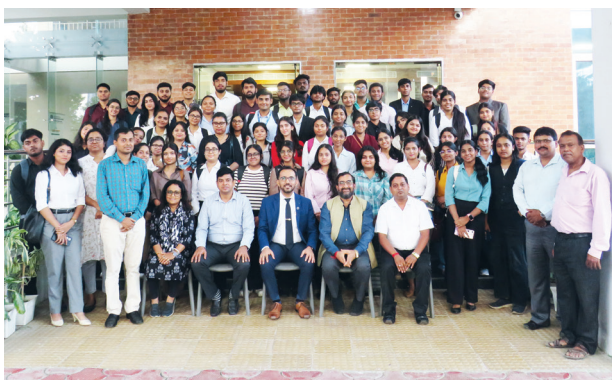
13 th Three Days Orientation Programme was organised by EIRC of The ICSI at ICSI-CCGRT, Kolkata from September 8-10, 2025.