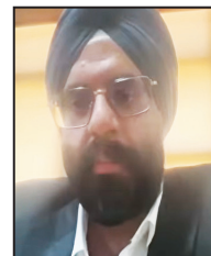
Moderator: CS NPS Chawla Central Council Member, The ICSI