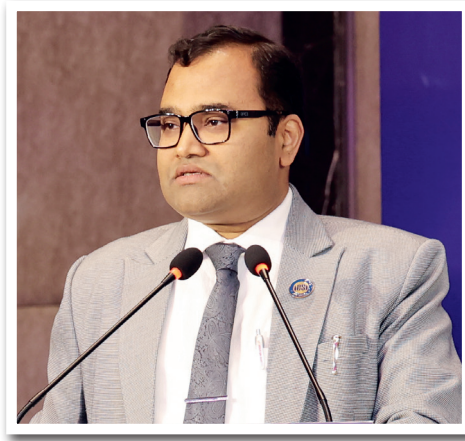
Fatum Fortes Adiuvat Fortune Favours the Brave.