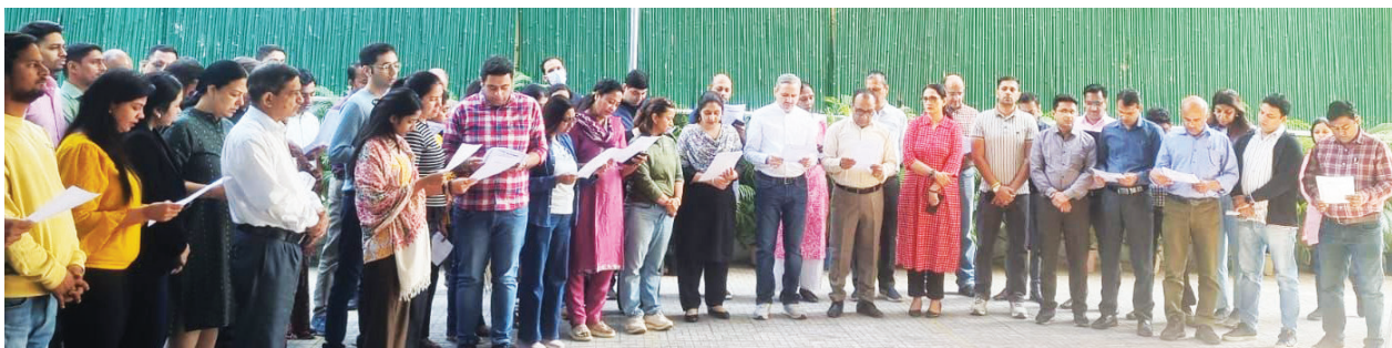
ICSI organised the inaugural celebration of commemoration of 150 Years of the National Song "Vande Mataram".