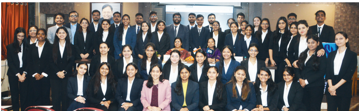
8 th Non-Residential CLDP was organized by ICSI-CCGRT, Mumbai from October 28 to November 12, 2025.