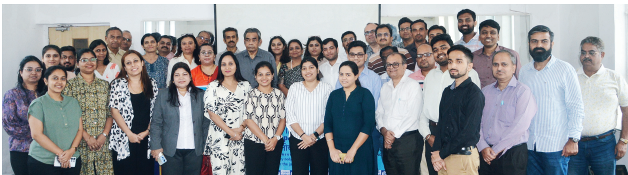
ICSI-CCGRT, Mumbai organized a comprehensive two days Residential/Non-Residential Workshop on 'FEMA' on November 15-16, 2025.