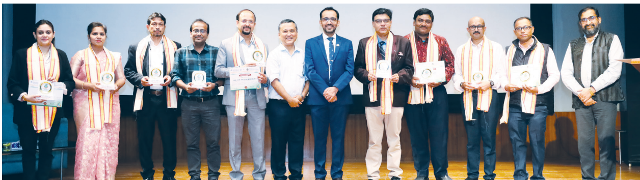
National Seminar of Kolkata Bidhannagar Society for Academic Advancement (KBSAA) in collaboration with EIRC of the ICSI and CCGRT held at ICSI-EIRC, CCGRT Kolkata Campus on November 15, 2025.