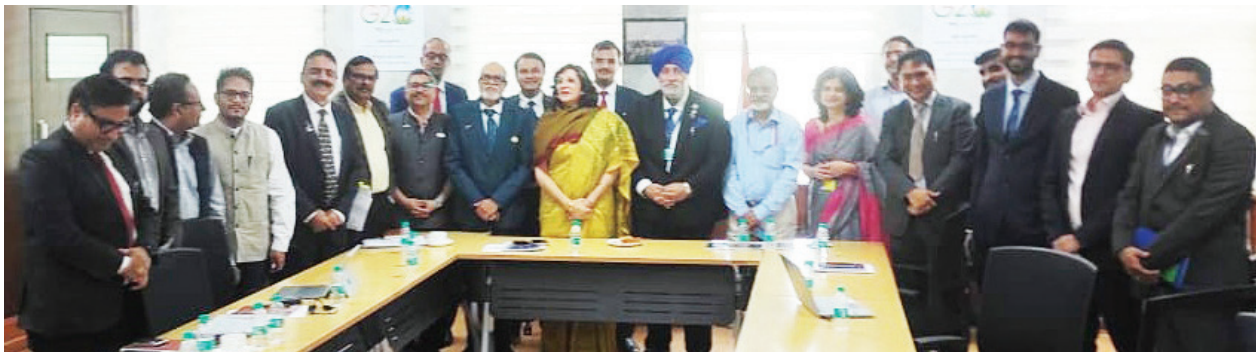
ICSI participated in Open House Session chaired by Secretary, MCA.