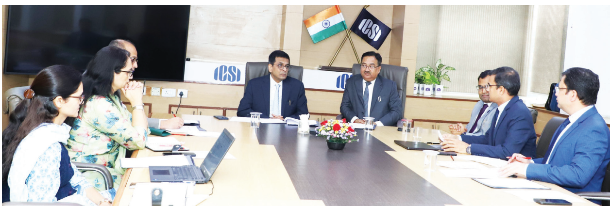
ICSI hosted Dr. Justice D.Y. Chandrachud, Hon'ble Former Chief Justice of India, at ICSI House, Lodi Road, and apprised him about the ongoing initiatives dedicated towards nation-building.