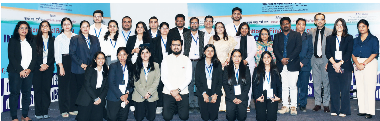
25 th All India Company Law Quiz – National Final Round held at ICSI-EIRC, CCGRT Kolkata Campus on November 8, 2025.