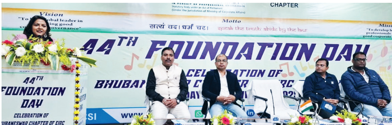
Bhubaneswar Chapter of EIRC of The ICSI celebrated its 44 th Foundation Day on November 23, 2025.