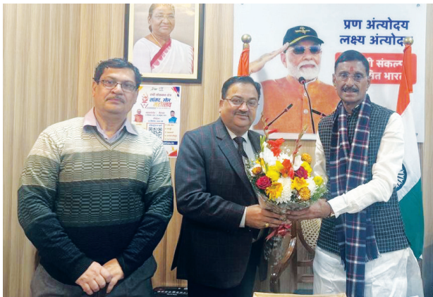
CS Dhananjay Shukla, President, The ICSI met with Shri Sanjay Seth, Hon'ble Minister of State for Defence and apprised him about the role of Company Secretaries and the ICSI in Nation Building.