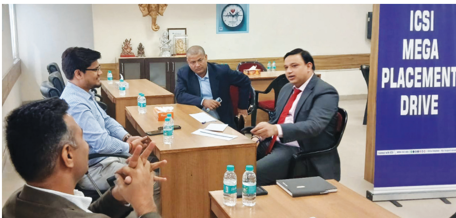
ICSI organised a Mega Placement Drive for Members and Students.