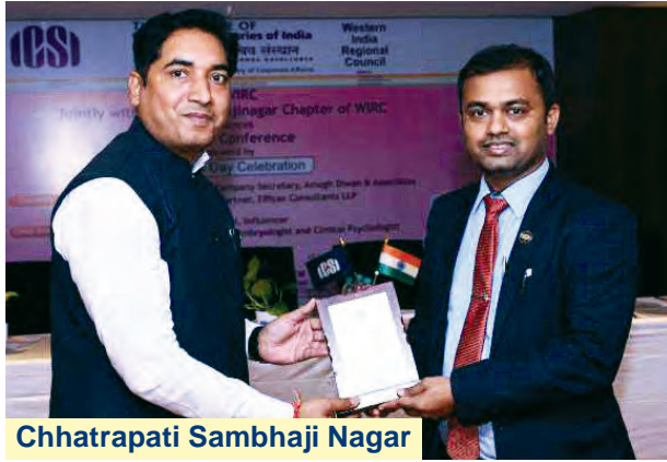
Chhatrapati Sambhaji Nagar