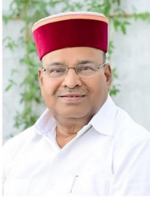
Governor of Karnataka