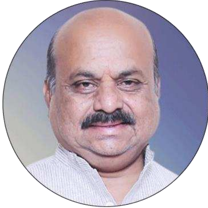
Hon'ble Shri Basavaraj Bommai Chief Minister, Karnataka

Shri Basavaraj Bommai is presently the Chief Minister of Karnataka. He is a graduate in Mechanical Engineering from B.V. Bhoomaraddi College of Engineering and Technology, presently known as KLE Technological University, and started his career with Tata Motors in Pune. He is also an agriculturist and industrialist by profession.