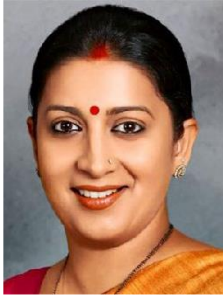
Hon'ble Smt. Smriti Zubin Irani Union Minister of Women and Child Development Member of Parliament (Lok Sabha) From Amethi, Uttar Pradesh

Smt. Smriti Zubin Irani is currently the Union Minister for Women & Child Development. She was the Union Minister for Human Resource Development from May 2014 to July 2016, Minister for Information & Broadcasting from July 2017 to May 2018 and Minister for Textiles from July 2016 to July 2021.