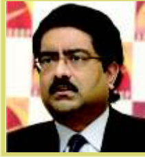
Mr. Kumar Mangalam Birla 2011