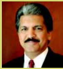
Mr. Anand Mahindra 2012