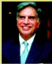
Mr. Ratan Tata