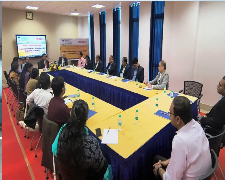
Previous Residential Programme