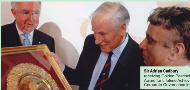
Sir Adrian Cadbury receiving Golden Peacock Global Award for Lifetime Achievement in Corporate Governance in 2016

Currently, the Golden Peacock Awards Secretariat is inviting applications for the following institutional awards for 2017: