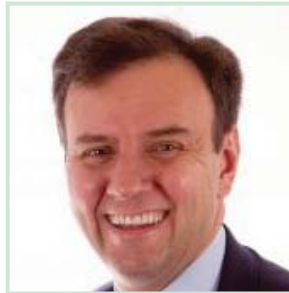
The Rt Hon Greg Hands MP Hon'ble Minister of State for Trade and Investment and Minister for London Govt. of U.K.