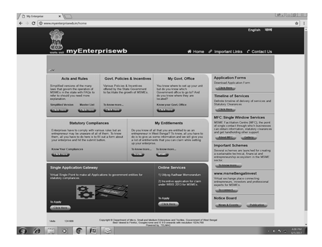
Figure-1: Screen Shot of Government of West Bengal's Portal for MSMES

There is an online pro forma seeking answer to the compliance questions that the entrepreneur needs to fill in. Once the fully filled-in pro forma is submitted a checklist of statutory compliances required for that particular enterprise is provided.