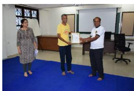
The ICSI-Bengaluru Chapter celebrated International Yoga Day on 21st June 2018 at the Chapter Premises.