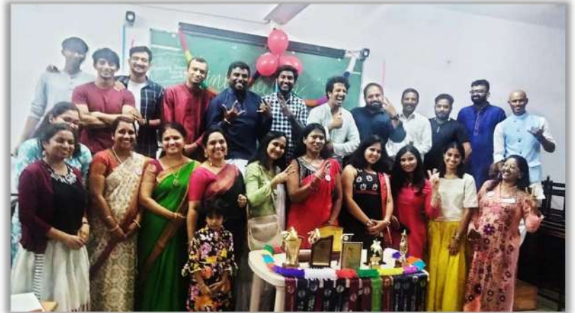
Navarathri Celebrations with Mysore Toastmasters Club