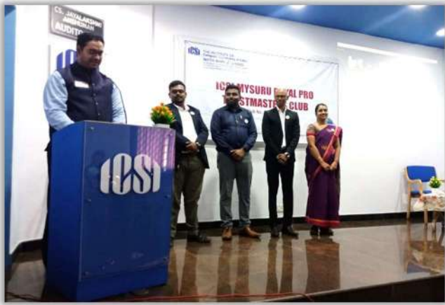
Installation Ceremony of the Current Club Officers