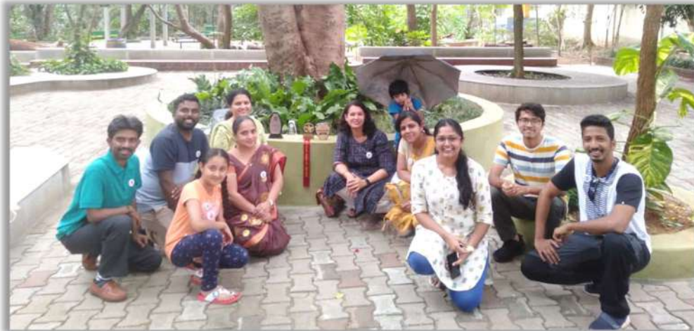
1st Outdoor Meeting of the club members