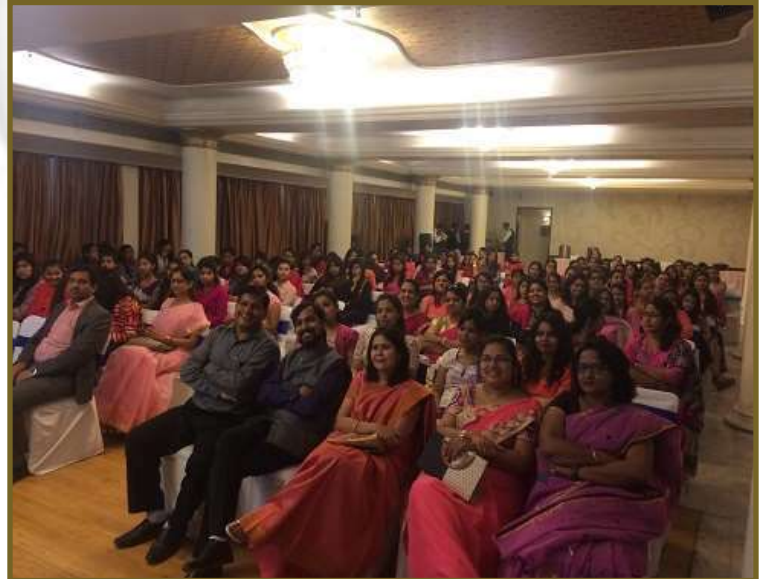
Workshop Series on Goods & Service Tax (GST) 1-5 March, 2017