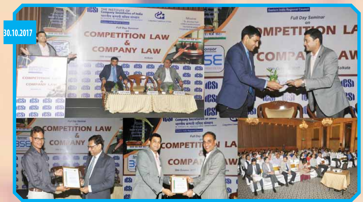
Full Day Seminar on "Competition Law" and "Company Law"