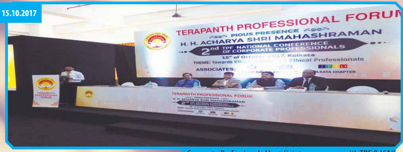
Corporate Professionals Meet (joint programme with TPF & ICAI)