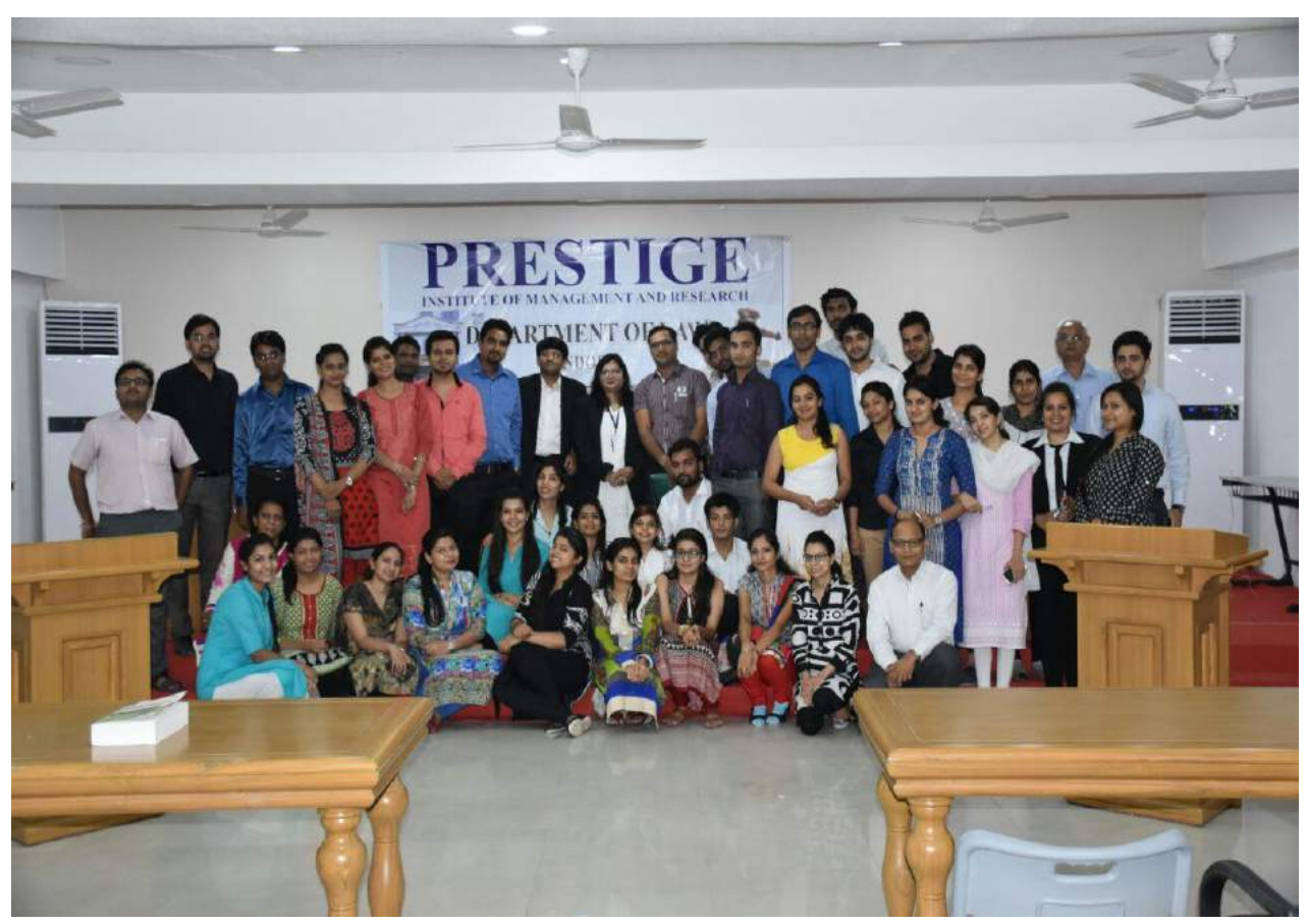
Moot Court Activity at Prestige Institute of Management & research, Department of Law, Indore